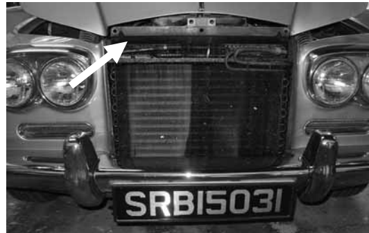
Figure 4-2-2 – Access improves with the deflector panel out.

As you can see in fig. 4-2-1, the radiator support underneath the power steering cooler can completely fill with fluid. Access to the unit is improved if the deflector panel