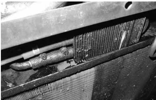
Figure 4-2-1 – Radiator support drowning in fluid.

The materials needed to fix the leaks are limited to one foot of 3/8-inch I.D. power steering return line and four hose clamps. Name brand hose stock such as Goodyear and stainless hose clamps are available at